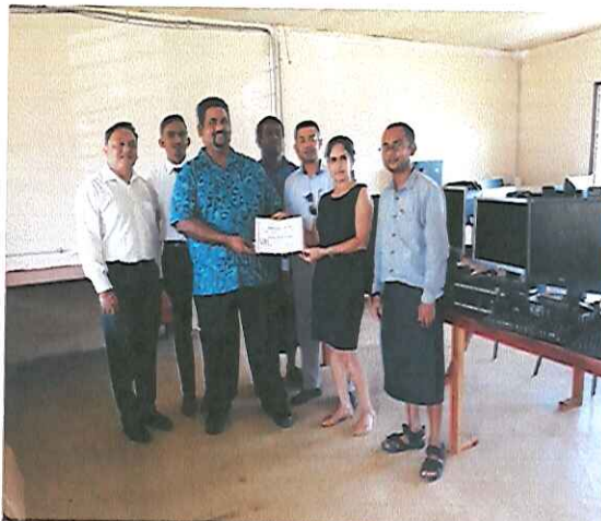
Navosa Central College