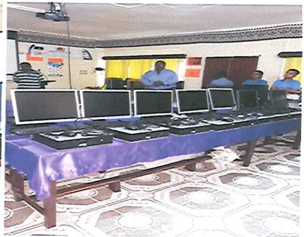
Saint Teresa Lisieux College

VBH established in 1945 and has been setting aside a portion of its profits to provide educational scholarships. Since mid 90's it has provided school fees for high school students, who could not complete their studies due to financial constraints but had good marks.