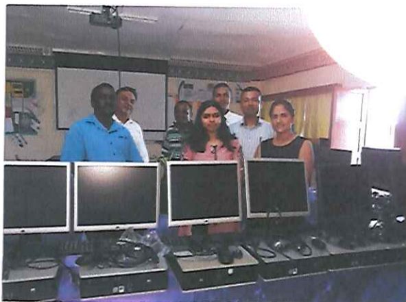
Lomawai High School

The program over the years grew to providing school fees for some 70 students a year. However, VB Holdings Ltd under its Corporate Social Responsibility Program, now donates computers to schools instead, since the Government provides school fees and other educational assistance.