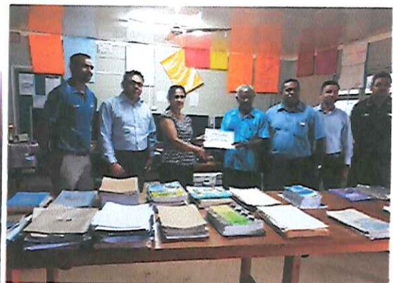
Nakauvadra High School